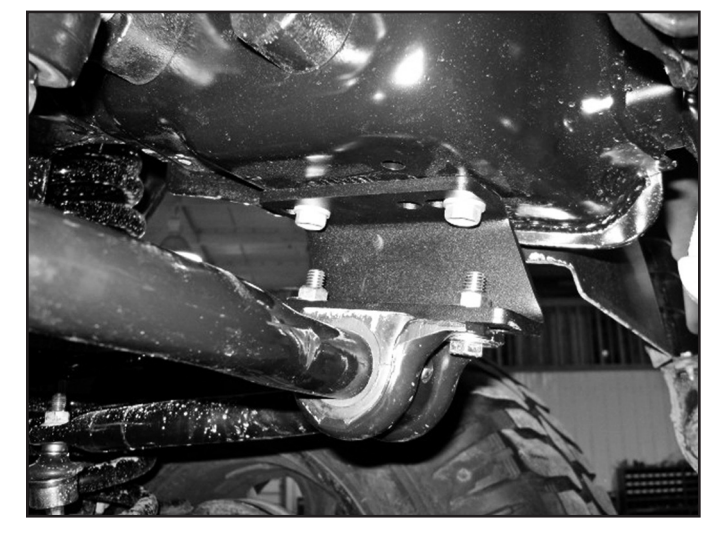
FIGURE 20 FIGURE 21

34. Install the sway bar drop brackets with factory hardware to the frame. The flat side of the bracket will face "out" and the brackets will offset the sway bar slightly forward. Attach the sway bar to the drop brackets with 3/8" hardware (Bolt Pack 422), tighten factory hardware to 43 ft-lbs and 3/8" hardware to 37 ft-lbs. (Fig. 20, 21)