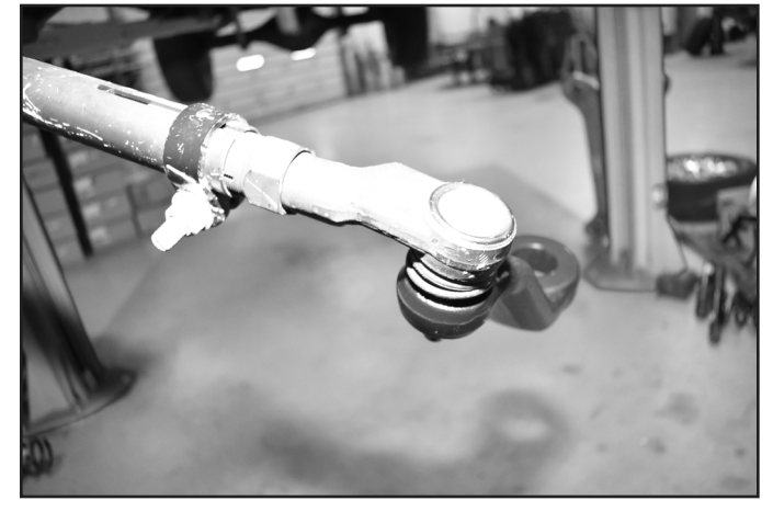
FIGURE 15 FIGURE 16