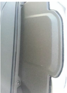
2015-2020 4X2 WITHOUT TOW HOOK