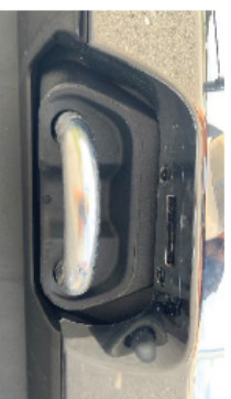
2021+ NO CUTTING REQUIRED. REMOVE TOW HOOK BOOT OR COVER PLATE