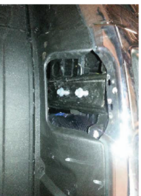
2015-2020 4X4 WITH TOW HOOK