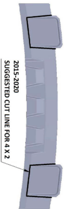
2015-2020 SUGGESTED CUT LINE FOR 4 X 2