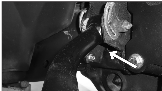
FIGURE 4 (DROOP LIMITER REMOVED)